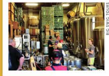
BIG SWIG TOURS

Big Swig departs six days a week in the summer and offers by-appointment outings throughout the winter. The company is developing an expanded tour that will soon travel to breweries in the Matanuska-Susitna Valley, north of Anchorage.