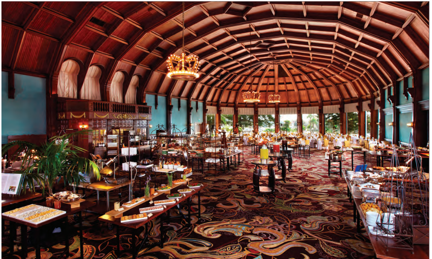
When the Crown Room was built, it was considered an architectural feat, as the 160x60 foot room with an impressive 33 foot ceiling required no pillars or center supports. Today, the room can be visited for a fabulous Sunday brunch.

Hotel del Coronado is located at 1500 Orange Avenue in Coronado, California. For more information, visit www.hoteldel.com or call 619/435-6611. ■